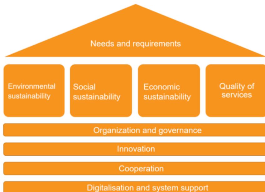
Illustration: The house of public procurement strategy found as case PS 157/22 presented to the City Council in October 2022

The procurement strategy of Bodø Municipality was formally accepted by the city council in October 2022, and it is showcased in the image below: